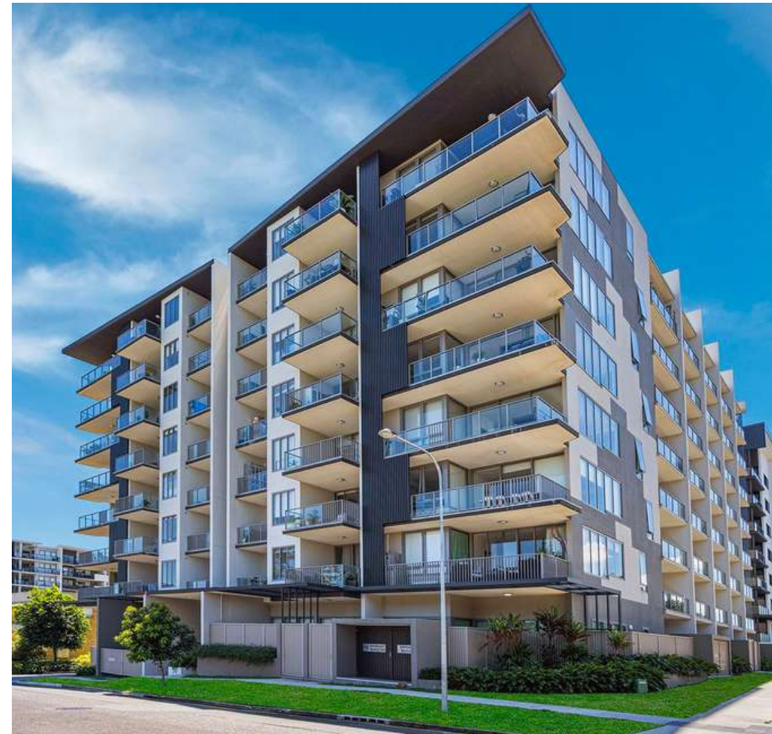
Lincoln on the Park, Australia

https://propertymash.com/brisbane/brisbane-south-east/lincoln-on-the-park-investment-apartments-in-stones-corner/