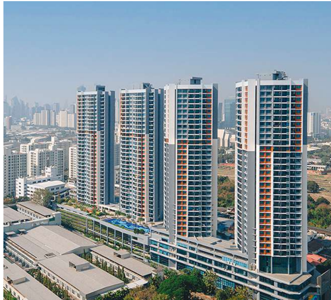
The Artisan, Thailand