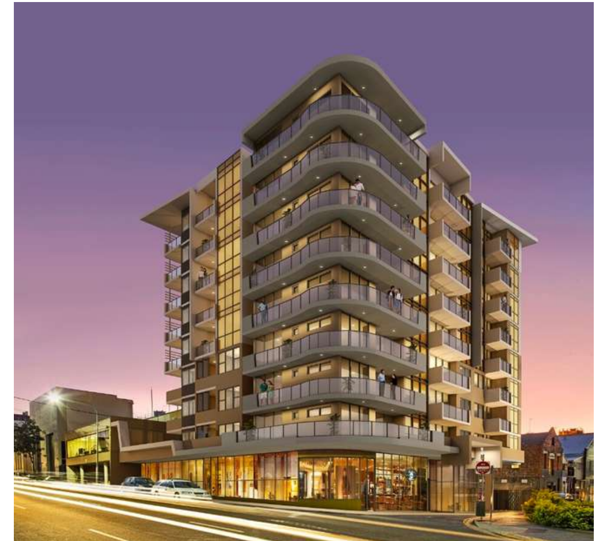
Thee Winn, Australia

https://propertymash.com/brisbane/brisbane-south-east/lincoln-on-the-park-investment-apartments-in-stones-corner/